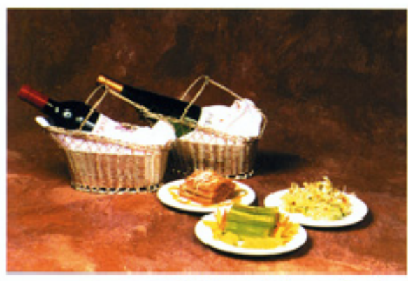
Delicious Chinese Cuisine