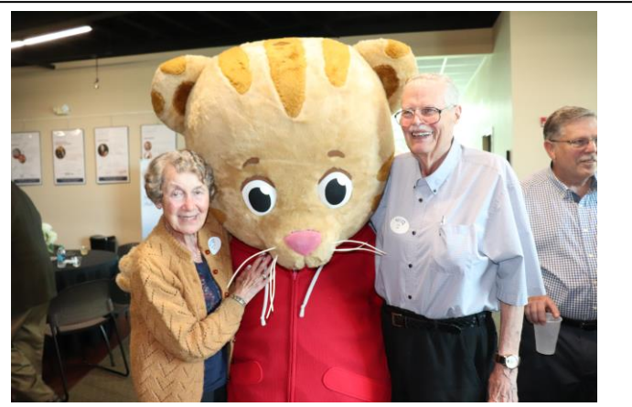
People of all ages enjoy meeting Daniel Tiger at WTVP 47@47 Open House

Our Facebook page and Twitter feed expanded, offering late-breaking news, behind-the-scenes production notes, and exclusive social media content. links to further information.