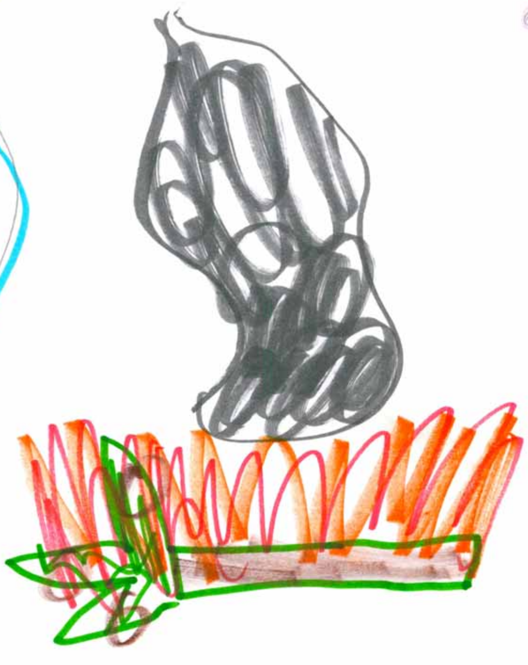
I will now light all the maches and put one of the tree's on fier. All the smoke rose and the rescue plane was able to see them. They got on the rescue plane and suddenly my Grandpa woke up.

I will now light all the maches and put one of the trees on fier. All the smoke rose and the rescue plane was able to see them. They got on the rescue plane and suddenly my Grandpa woke up.