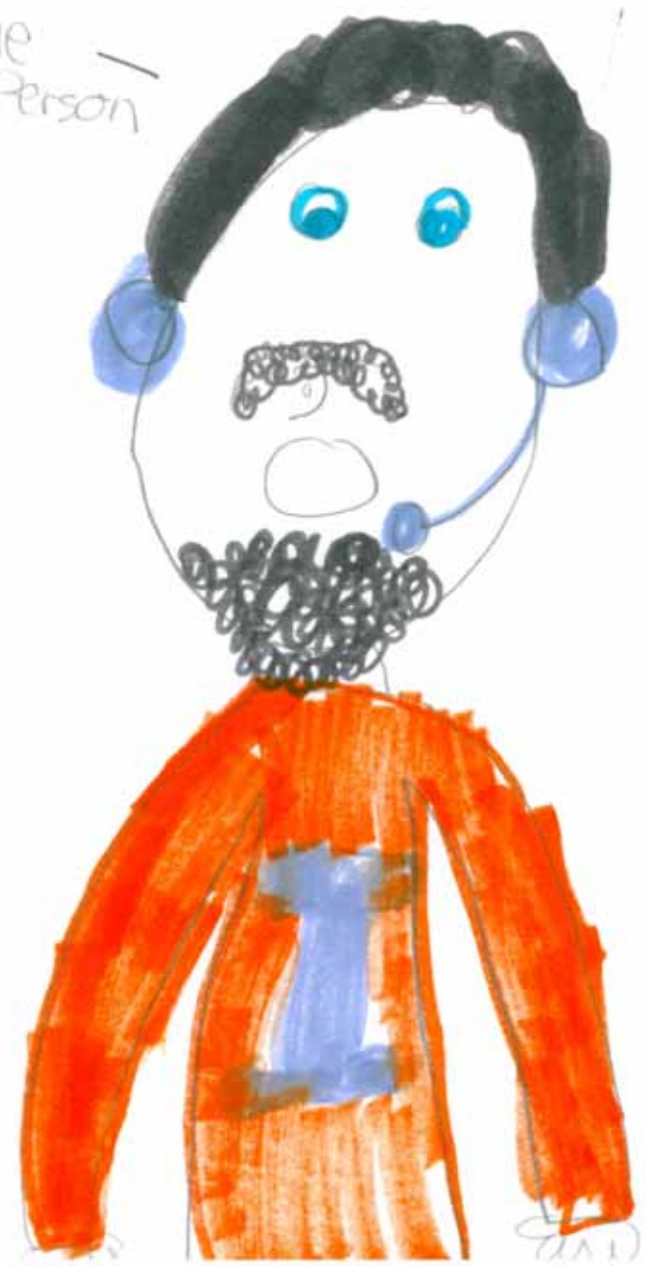
The rescue plane said where were you heading? My Grandpa's friend said well...we were going to Hawaii. OK. We were almost there. How about I get in the plane and get something. Maybe I have maches I there. I do! I do!