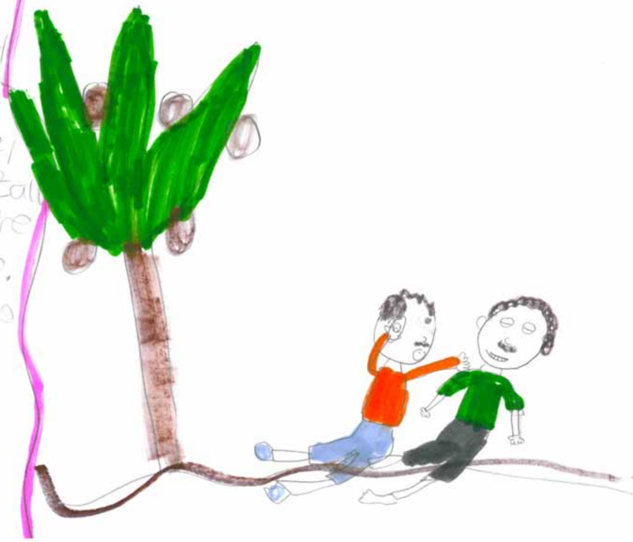
He started to fall and they crashed. My Grandpa was hurting bad when they crashed. His friend called nine-one-one. The nine-one-one call asked where they were. He said he didn't know.

He started to fall and they crashed. My Grandpa was hurting bad when they crashed. His friend called nine-one-one. The nine-one-one call asked, where they were. He said he didn't know.